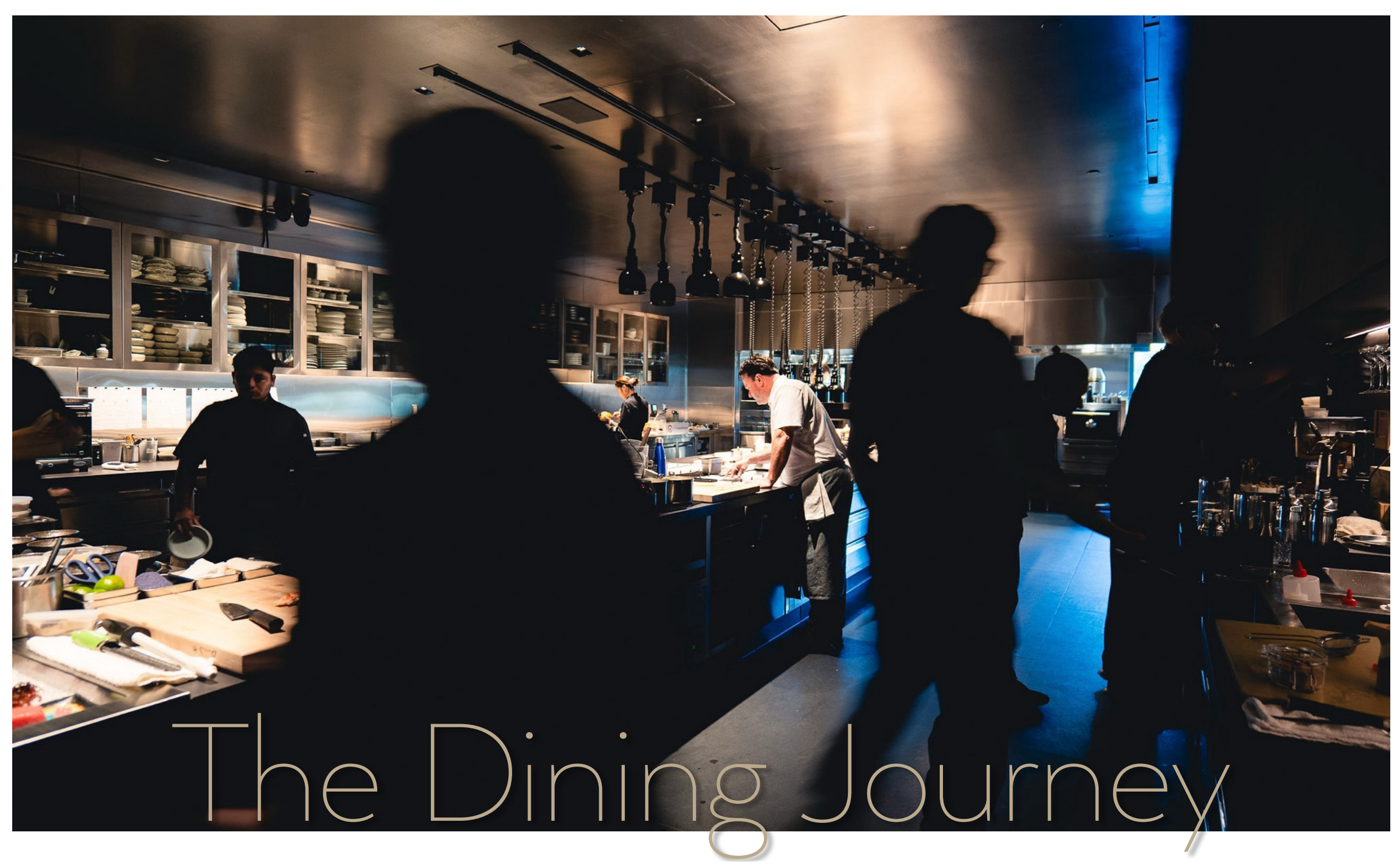
A Private Dining Experience at Michelin Starred Cyrus Restaurant